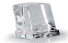
Full Cube - 12 G (26,5 x 26,5 x 26 mm)